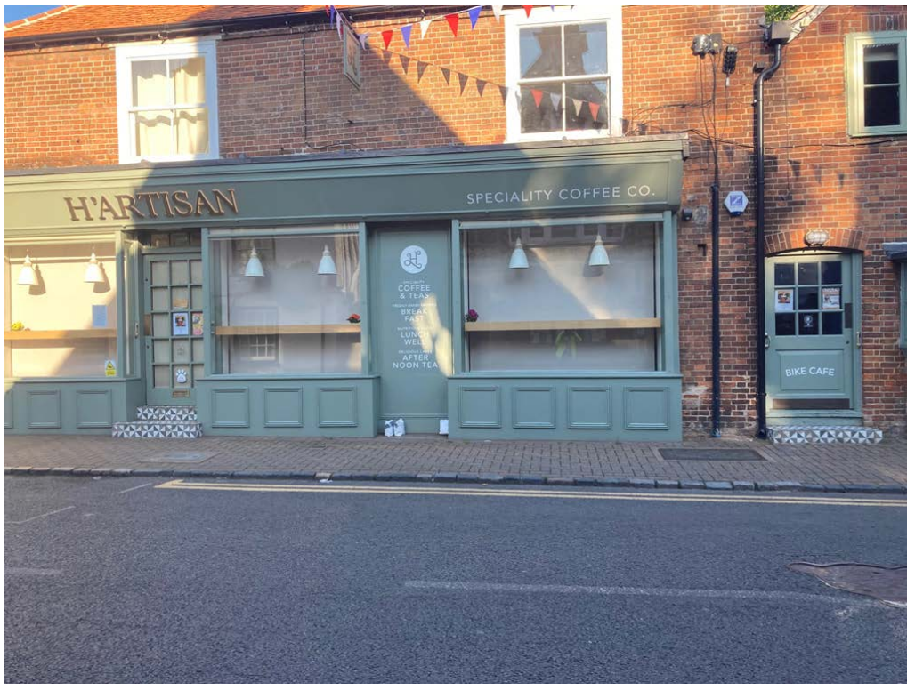
Appendix B Photo of Site Notice